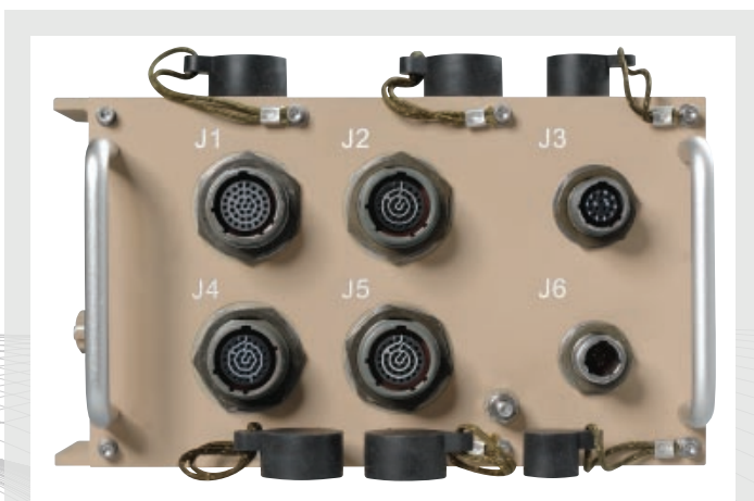
Ethernet, Serial, and USB connections can be shared across multiple units by using the GMR