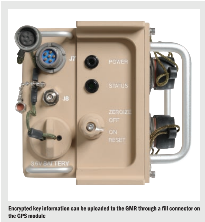
Encrypted key information can be uploaded to the GMR through a fill connector on the GPS module