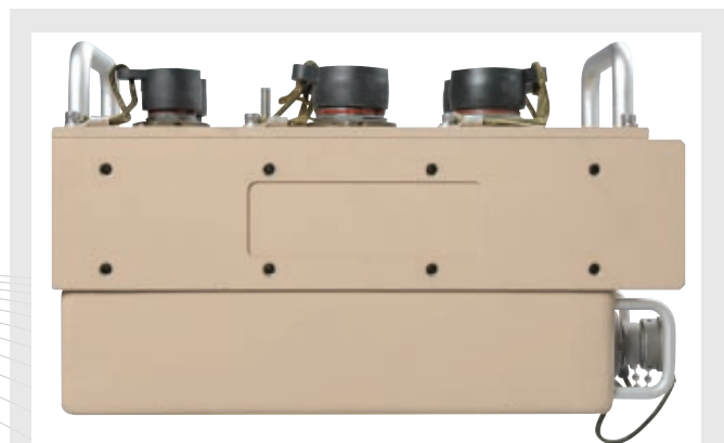
The GMR incorporates three previously separate modules (GPS, Ethernet hub and micro router) into one convenient solution

For more information on our rugged products, please visit: